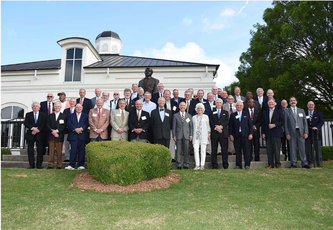
Members of Wofford's Class of 1974 rekindled friendships and created new memories during Commencement Weekend.