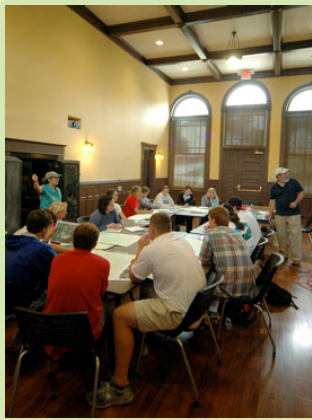
Lab students in the Great Room at the Goodall Center for Environmental Studies.

The Goodall Environmental Studies Center has received the U.S. Green Building Council's Leadership in Energy & Environmental Design Platinum certification, the highest achievable level of LEED. It is the first academic building and only the third non-residential facility in the state to achieve that level. LEED is a national green certification program, which reviews building performance in five areas: energy efficiency, indoor environmental quality, materials selection, sustainable site development and water savings.